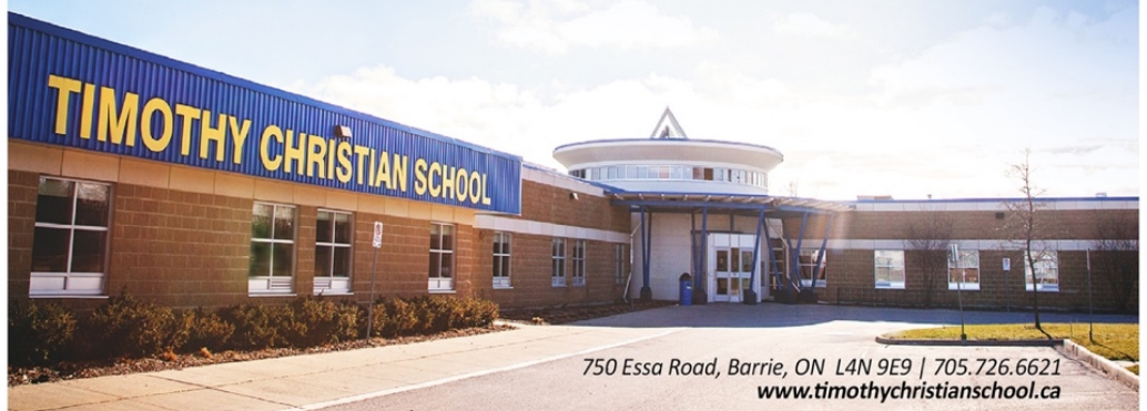
750 Essa Road, Barrie, ON L4N 9E9 | 705.726.6621 www.timothychristianschool.ca