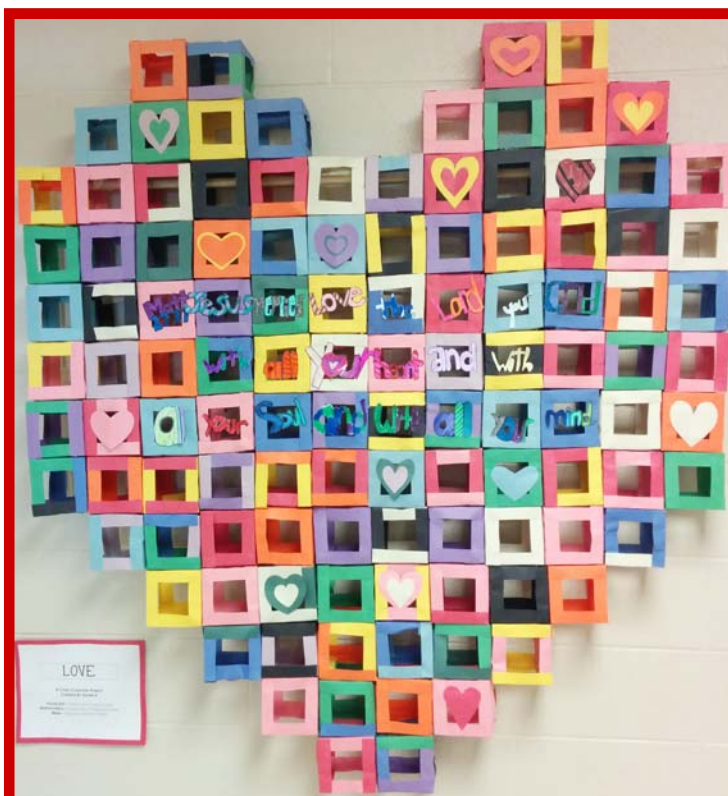
LOVE—A Cross-Curricular Project Created by Grade 6 Visual Arts—Warm and Cool Colours Mathematics—Geometric Shapes and Nets Bible—February Memory Verse